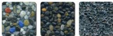
Midnight Sea Jet Black Black Velvet