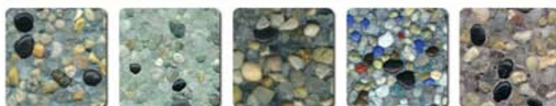
Northshore Caribbean Irish Creme Northshore Tahoe Tahitian Tropical Northshore Plum