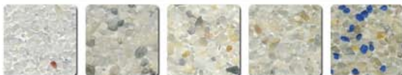
Polar White White Diamonds Champagne Supreme White Cool Blue