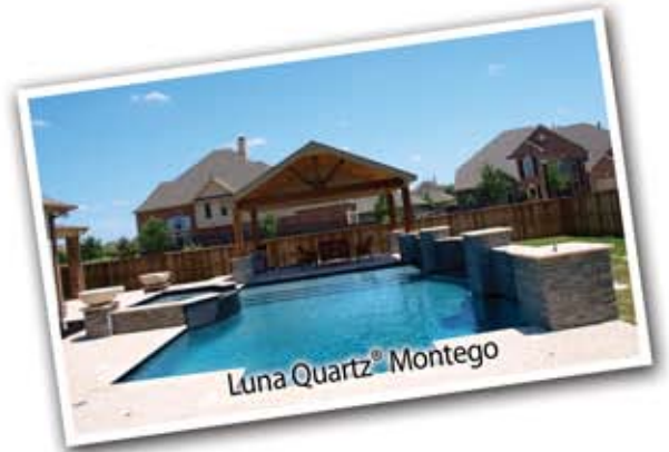
Luna Quartz® Montego