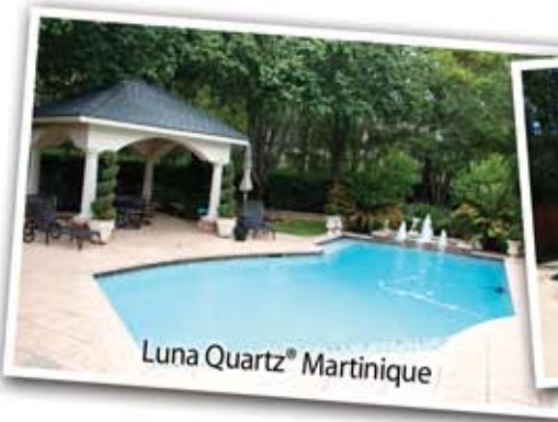
Luna Quartz® Martinique