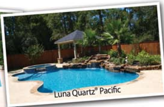
Luna Quartz® Pacific